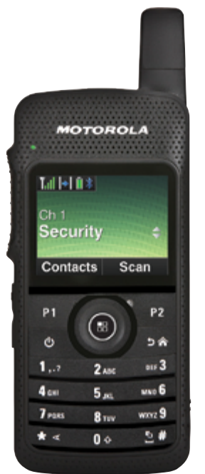
SL 7500 SERIES