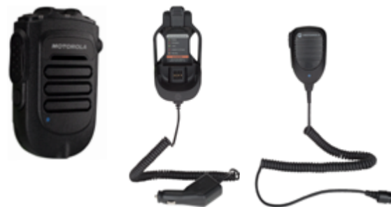
RLN6551 Long Range Wireless Remote Speaker Microphone Kit