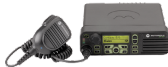
XPR 4000 Series

The Long Range Wireless Remote Speaker Microphone (RSM) pairs instantly with touch pairing to the mobile microphone with Bluetooth gateway. The Bluetooth microphone is compatible with MOTOTRBO XPR 4000 and XPR 5000 series mobile radios. The Long Range Wireless RSM works up to 100 meters away from the mobile radio, keeping you in communication where you never thought possible.